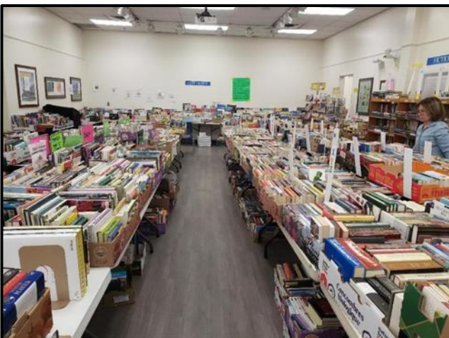
Has anybody seen my book?