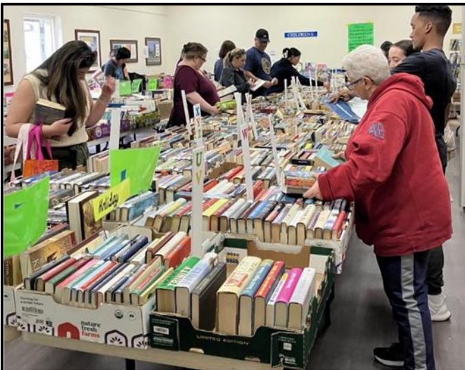
Hunting for bargains at the Friends' Book Sale!