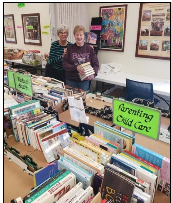
These should get me to the weekend!