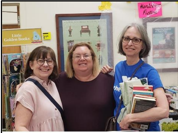
The Friends Book Sale is our Happy Place!