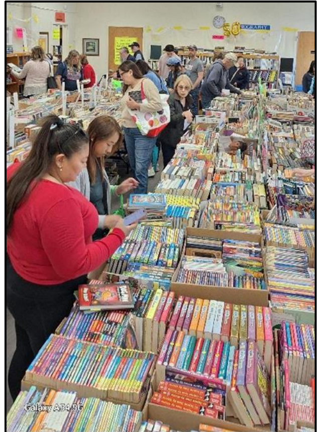
So Many Books...So Little Time!