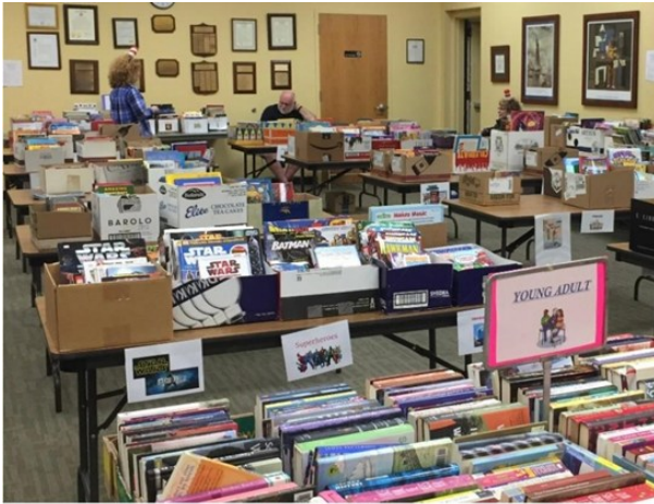
Bring on the kids!

We received over 6,800 books from the community over the five donation days and sold most of them during the sale days. The remainder were donated to multiple groups including an organization assisting families dealing with domestic violence, Furniture Assist, child psychologists, Linden Elementary School #6, Rafael Hernandez School in Newark, Westfield Fun Club, which helps local refugees, Jewish Family Services in Elizabeth, the Mitzvah Circle and the Friends' Little Free Libraries located throughout Westfield.