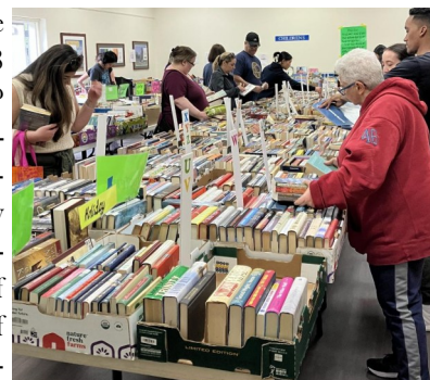
Hunting for bargains at the Friends' Book Sale!

Do you patronize the Friends Book Sale each Spring and The Children and Teen Book Sale in the Fall? Have you purchased a jigsaw puzzle at our annual sale or ongoing "Pop-Up" sale in the Library lobby? Have you visited one of the 28 museums in the Friends' Museum Pass Program? Do your children participate in the Friends-sponsored Saturday Children's Programs each winter? Have you visited the opera or a Broadway show as part of a Friends-sponsored event? Have you attended a Friends' Book Discussion or visited one of the Friends seven Little Libraries around town? If you answered yes to any of these questions, you appreciate the value the Friends add to the Westfield Memorial Library.